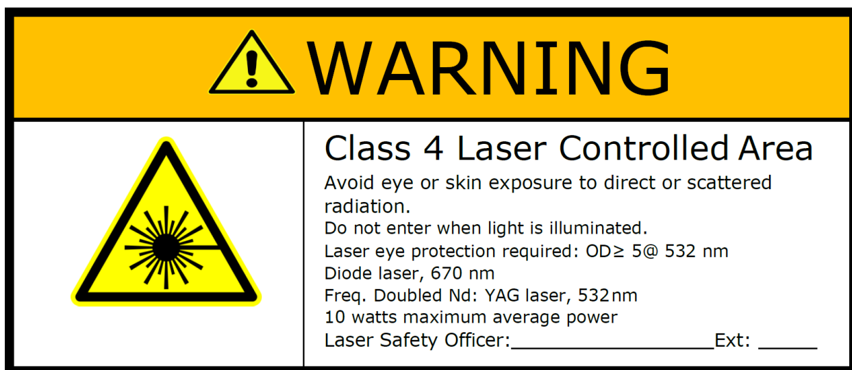
Figure: 25 TAC §289.301(u)(3)(B)(iv)

(iv) The following sign meets the requirements of this subparagraph.