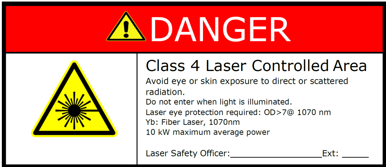
Figure: 25 TAC §289.301(u)(3)(A)(iv)

(iv) The following sign meets the requirements of this subparagraph.