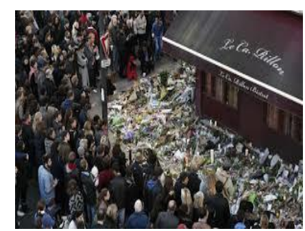
Images Sourced from - Complex Coordinated Terrorist Attacks Paris 2015 - Google Search