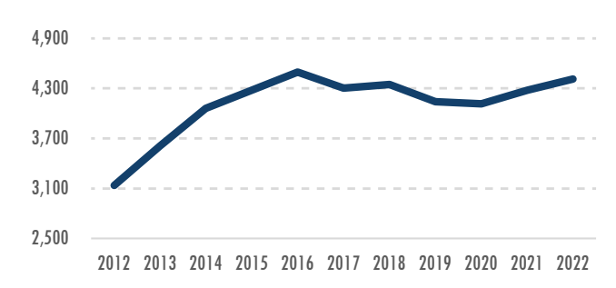
Figure 1. Total SLPAs in Texas