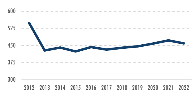
Figure 2. Ratio of Texas Population to LPO<sup>1</sup>