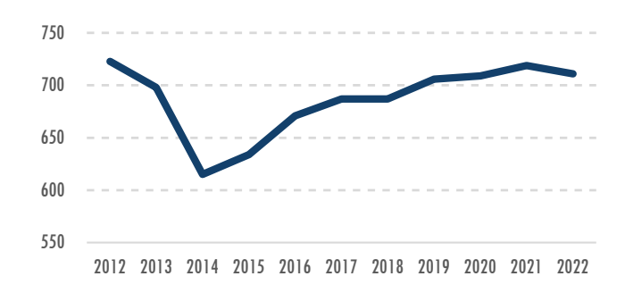
Figure 1. Total HIFDs in Texas