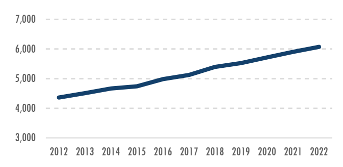
Figure 1. Total Dietitians in Texas