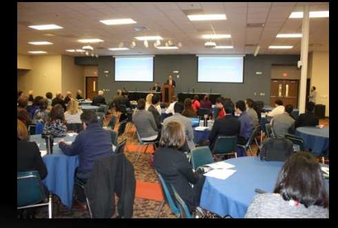
UTRGV & HCHHSD Disease Forum

High Consequence Infectious Disease Response