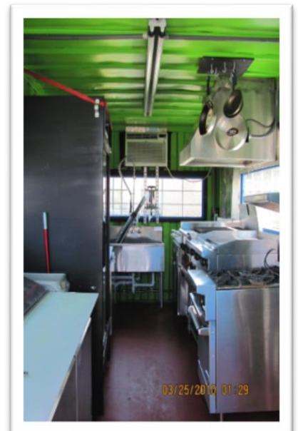
Smooth and cleanable surfaces