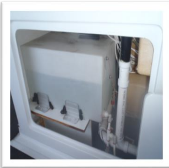
Potable Water Tank