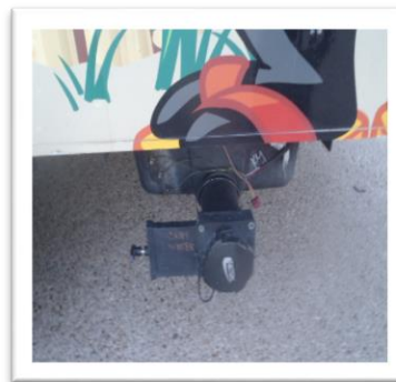
Liquid Waste Connection