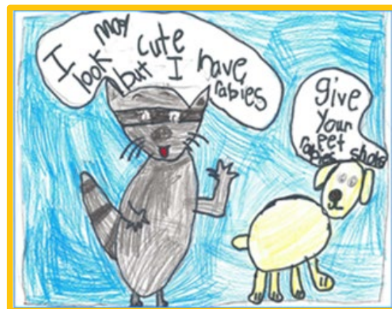
2022 Public Health Region 7 Winners

Please forward this information to the teachers in your school and encourage them to involve their students. Provided online is an information sheet for students and a teacher instruction sheet with details and an entry form: www.dshs.texas.gov/idcu/disease/rabies/information/contest/ . The deadline for poster submission is April 7, 2023. If you are interested and need additional information, please email The.Vet@dshs.texas.gov or call 512.776.7255.