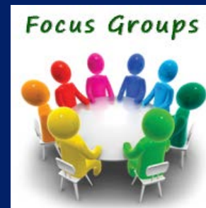
Client Focus Groups